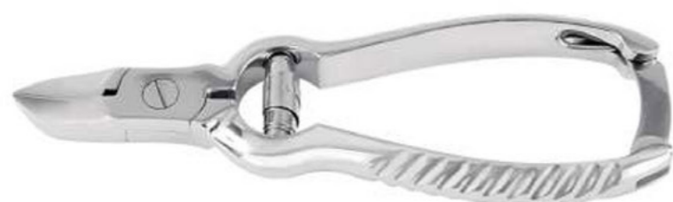
MJW-3140-120 puffer spring nail cutter lap joint fluted handle with lock Size 14cm