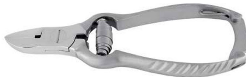
MJW-3330-120 puffer spring nail cutter lap joint fluted handle with lock Size 14cm