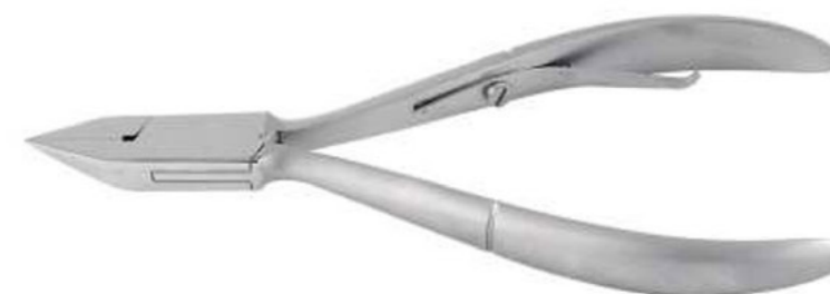
MJW-3320-120 Nail cutter box joint fine jaws single spring Size 12cm