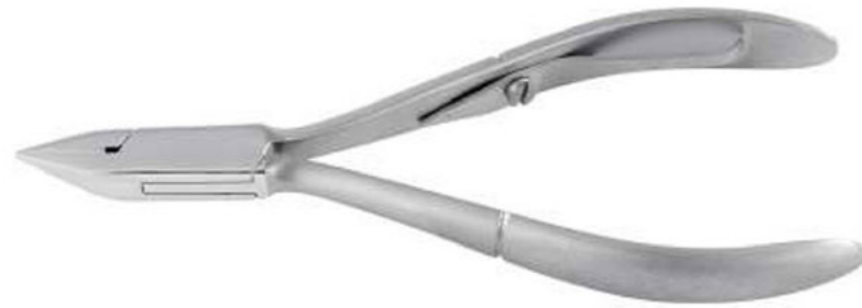
MJW-3321-120 Corner cutter box joint fine jaws single spring Size 13cm