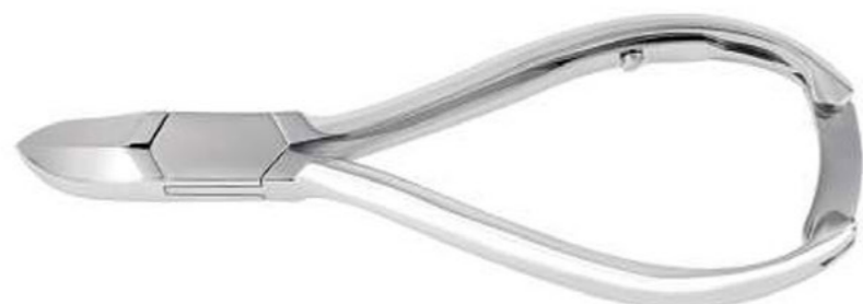
MJW-3109-120 Pedicure Nail Cutter box joint single spring plain handlewith lock Size 14cm