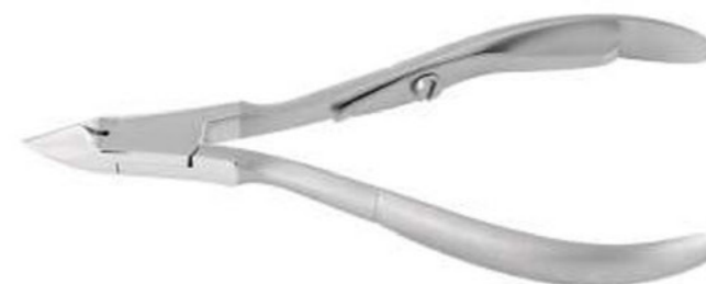
MJW-3301-120 Cuticle nipper lap joint beak size 7mm single spring Size 10cm