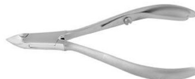
MJW-3305-120 Cuticle nipper box joint beak size 5mm single spring Size 10cm