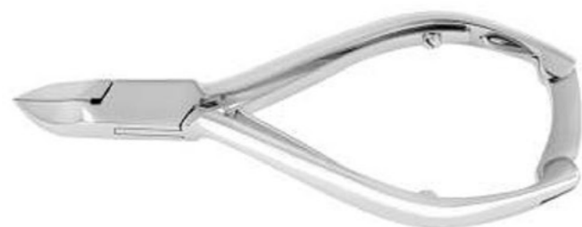
MJW-3110-121 Pedicure Nail Cutter box joint double spring plain handlewith lock Size 11.5cm