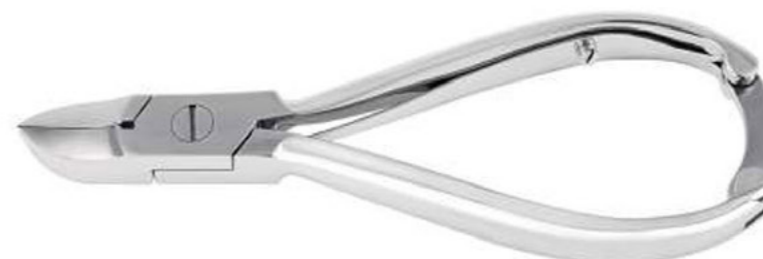
MJW-3135-120 (12cm) MJW-3136-120 (14cm) Nail Cutter lap joint single spring plain handlewith lock