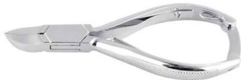
MJW-3101-120 Pedicure Nail Cutter box joint double spring chequered handlewith lock Size 14cm