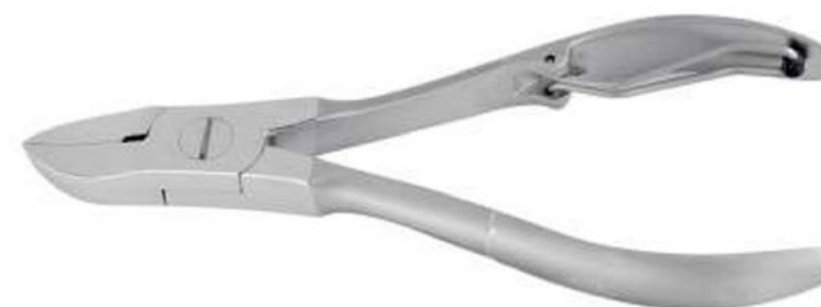
MJW-3311-120 Nail cutter wire spring lap joint Size 12cm