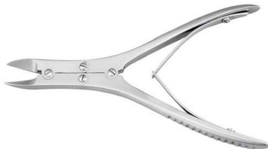
MJW-3160-120 Multi-action pedicure nail cutter double spring fluted handle Size 15cm