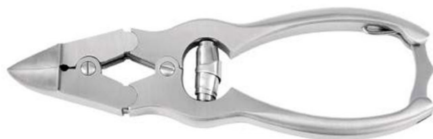
MJW-3160-120 (plain handle) MJW-3161-120 (chequered handle) Multi-action pedicure nail cutter with lock Size 16cm