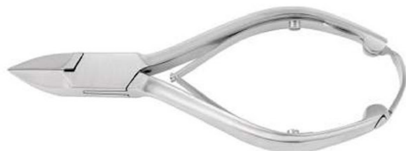
MJW-3105-120 Pedicure Nail Cutter box joint fine jaws double spring plain handlewith lock Size 14cm