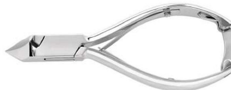
MJW-3122-120 Head Cutter box joint convex jaws double spring plain handlewith lock Size 14cm