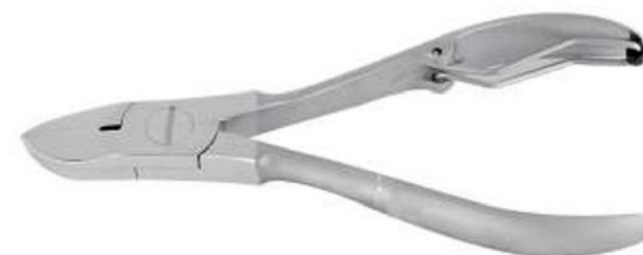
MJW-3310-120 Nail cutter wire spring lap joint Size 10cm