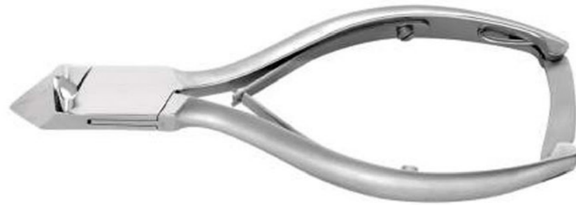
MJW-3325-120 Head cutter box joint double spring with lock Size 14cm