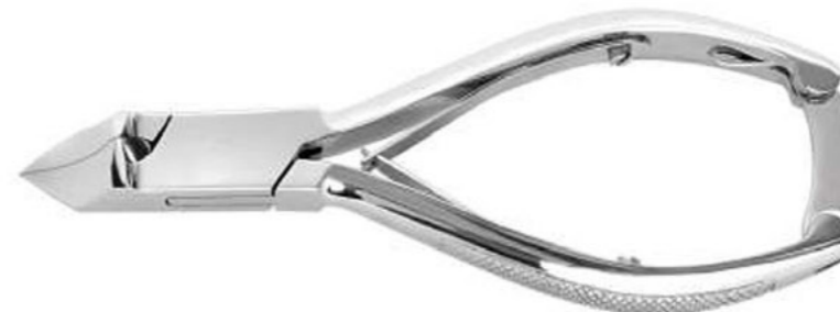
MJW-3120-120 Head Cutter box joint double spring chequered handlewith lock Size 14cm