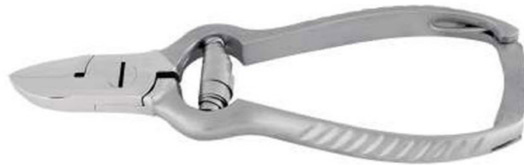
MJW-3329-120 puffer spring nail cutter lap joint fluted handle with lock Size 12cm