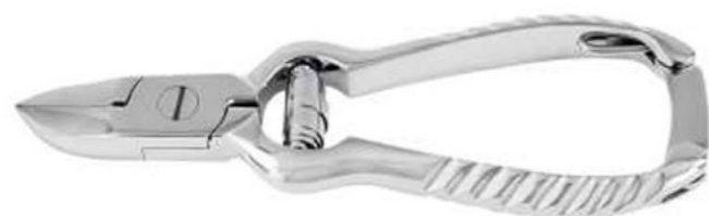
MJW-3141-120 puffer spring nail cutter screw joint fluted handle with lock Size 12cm