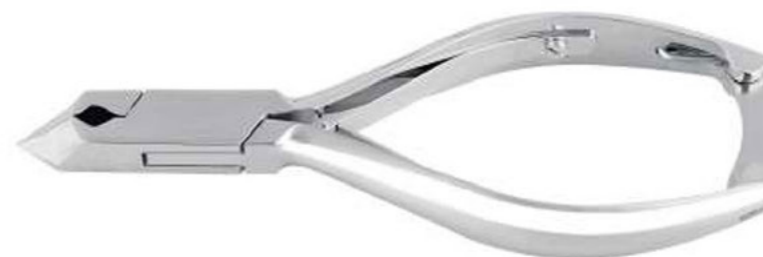
MJW-3125-120 Head Cutter box joint half jaws double spring plain handlewith lock Size 14cm