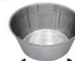
31-255 To 31-256