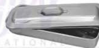
31-152 To 31-153