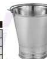
31-248A To 31-250D