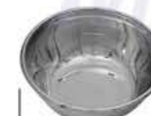
31-215 To 31-228