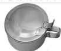
31-289 To 31-291