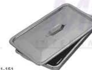
31-144 To 31-151