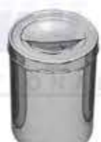
31-260 To 31-266