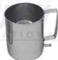
31-257 To 31-259