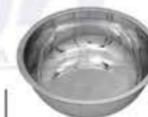
31-210 To 31-214