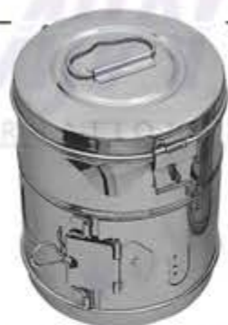
31-101 To 31-118