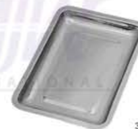
31-136 To 31-143