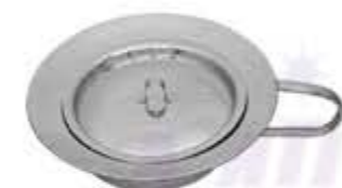
31-201 To 31-202