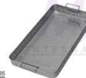
31-131 To 31-135