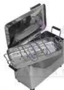
31-120 To 31-125