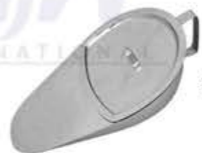
31-197 To 31-198