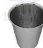
31-245 To 31-247