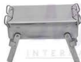
31-126 To 31-130