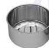
31-207 To 31-209