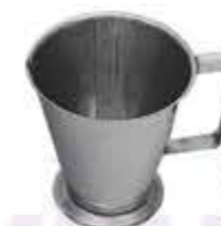
31-251 To 31-254