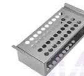
31-294 To 31-296