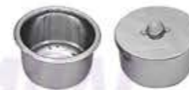
31-229 To 31-244