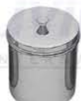
31-267 To 31-273