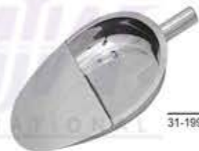
31-199 To 31-200