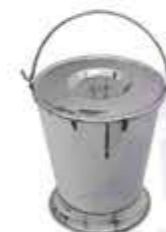
31-248 To 31-250