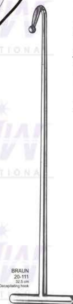
BRAUN 20-111 32.5 cm Decapitating hook