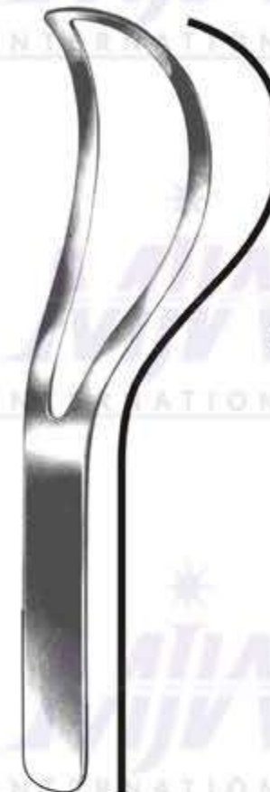
SELLHEIM 20-110 30 cm Obstetric lever