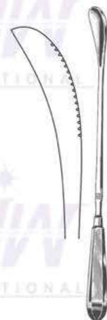
CUZZI 30 cm / 12"

20-107J 12 mm 20-107K 14 mm 20-107L 16 mm 20-107M 20 mm Blunt