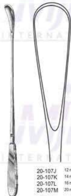
Wallich 20-107H 42 cm / 16 1/2"

20-107J 12 mm 20-107K 14 mm 20-107L 16 mm 20-107M 20 mm Blunt