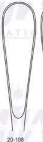
20-108 14.5 mm Blunt