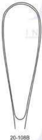
20-108B 21 mm Blunt