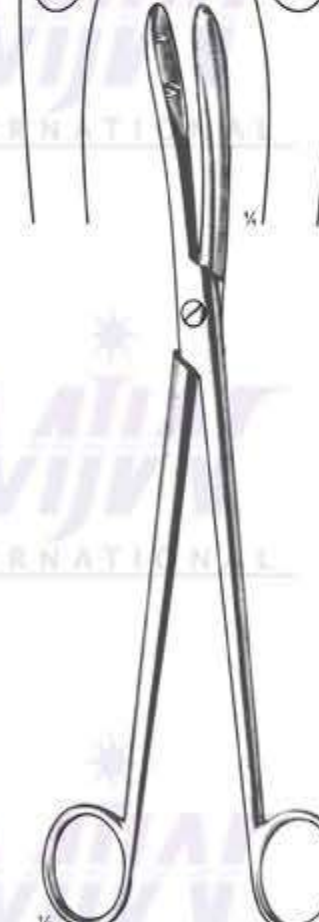
BOER 20-109 29 cm Craniotomy forceps