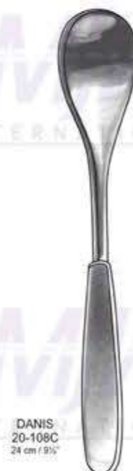
DANIS 20-108C 24 cm / 9 1/2"