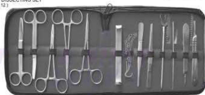
29-217 BASIC DISSECTING SETS (Set of 13) (In Attractive Zipper Case)