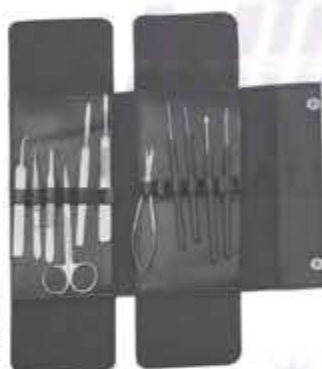
29-214 MICRO DISSECTING SET DOUBLE FOLDING LEATHER CASE.