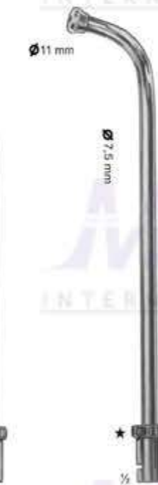
29-121 For tonsillectomy, oral and laryngeal operations 220 mm

With bayonet fitting to be used with suction handles (29-115 - 29-116)