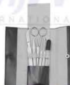
29-211 BASIC DISSECTING SETS VINYLE POUCH.