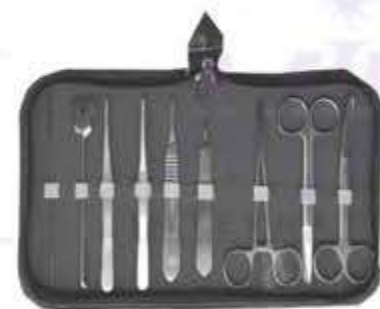
29-216 BASIC DISSECTING SETS In Attractive Zipper Case (set of 9)