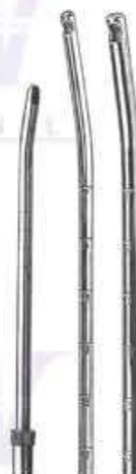
Uterine suction tubes