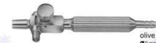
olive Ø 9 mm

29-116 170mm Suction handle, with hand regulation valve and quick-shutter, brass, mirror-finish chromium-plated