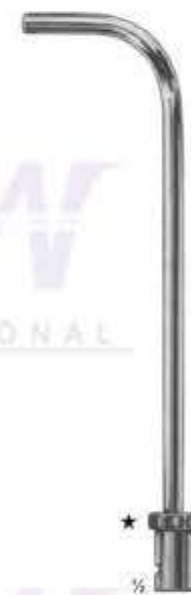
29-120 For tonsillectomy, oral and laryngeal operations 190 mm