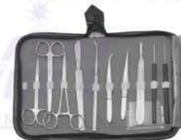
29-215 NEW INSTRUCTORS DISSECTING SET (Set Of 12)