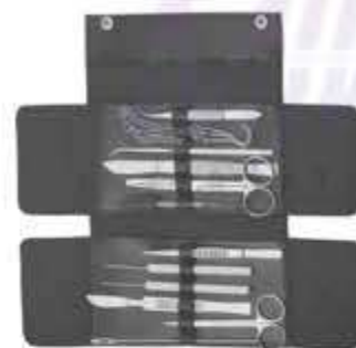
29-212 ANATOMY DISSECTING SET DOUBLE FOLDING LEATHER CASE.