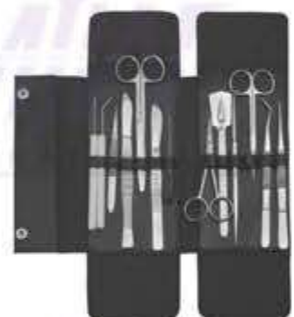
29-213 LARGE ANIMAL SET DOUBLE FOLDING LEATHER CASE.