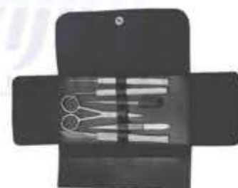
29-210 GENERAL BIOLOGY DISSECTING SET SINGLE LEATHER CASE.