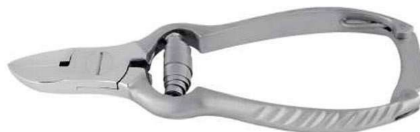
MJW-3330-120 puffer spring nail cutter lap joint fluted handle with lock Size 14cm