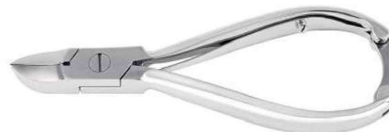
MJW-3135-120 (12cm) MJW-3136-120 (14cm) Nail Cutter lap joint single spring plain handlewith lock