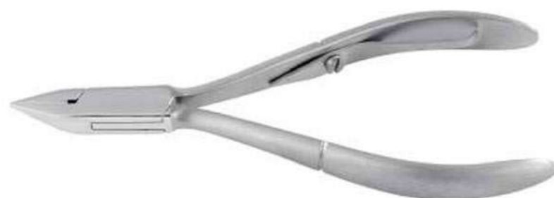
MJW-3321-120 Corner cutter box joint fine jaws single spring Size 13cm