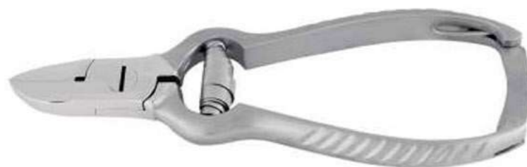
MJW-3329-120 puffer spring nail cutter lap joint fluted handle with lock Size 12cm