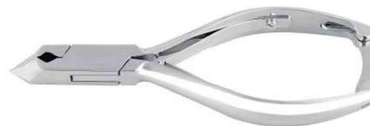
MJW-3125-120 Head Cutter box joint half jaws double spring plain handlewith lock Size 14cm